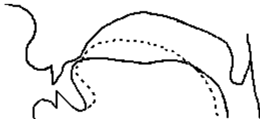
figure 2 Russian retroflex fricative (solid line) and palatalized postalveolar fricative (dashed line)

The incompatibility of gestures and the change in primary place is exemplified with the Russian fricatives in the postalveolar region. figure 2 is based on x-ray tracings of the Russian retroflex fricative (solid line) and its palatalized counterpart (dashed line) (both based on Bolla 1981: 159). As illustrated in Hamann (2002), the Russian postalveolar fricative is a retroflex which satisfies the property of retraction. 5