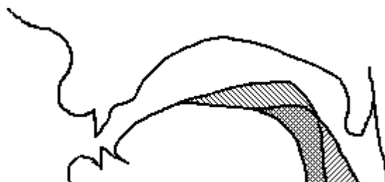
figure 1 Retraction, indicated as shaded areas, in comparison to neutral tongue position. The upper displacement is a velarization gesture, the lower pharyngealization.

‘Retraction’ is defined in the present article as a displacement of the tongue dorsum or root towards the pharynx or velum. A schema of these possible displacements is given in figure 1, based on x-ray tracings of velarized and pharyngealized segments in Laver (1994: 326ff.) and Ladefoged & Maddieson (1996: 365).