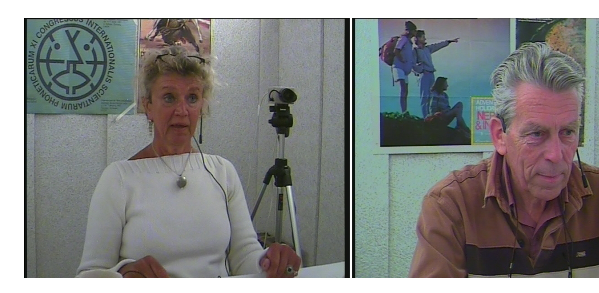
Figure 3: Example frame of recordings (output camera A, left; output camera B right)

annotations not present in the CGN (table 2). As gaze direction, the timing of looking towards and away from the other participant has been segmented in ELAN (2002 2007). Other annotation files use Praat TextGrid format (Boersma and Weenink, 1992 2008).