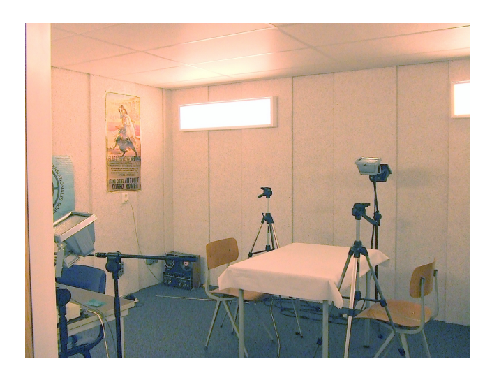
Figure 1: Recording room set-up. The distance between the speakers was around 1 m.

The result of these procedures was that the conversations are probably as free-form as can be obtained in a studio setting. The quality of the sound and video is high and even the gaze direction can easily be identified. This makes this corpus useful for many types of research, from classical conversation analysis to automatically detecting gaze direction and emotion in facial expressions.